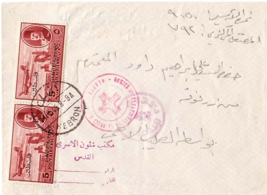
HEBRON 14 FEB 49 ✉ a letter from Hebron to an Arab prisoner of war in Israel, using the Red Cross service. Proper with 10 Mil franking, and violet cachet "to Arab prisoner of War in Israel" and censor.. Red cachet of the Red Cross in centre.