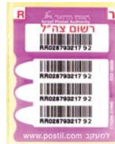
2006 new ISRAEL POST Barcode labels panes of 9

Background: violet and white. Constant text: In red "REGISTERED ZAHAL". Barcode in in black. Upper corners "R" in English left and Hebrew right. Israel Postal Authority printed (Eng. Heb.) and IPA logo. Label: self-adhesive with 4 bar-codes of which 3 are removable bar-code strips. Panes" 9 labels (3x3) Usage: prepared by civil postal administration for army mail that is sent registered to civil destinations. Enables follow-up with website www.postil.com